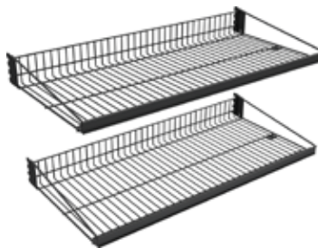
2', 3' or 4' Flat Wire Shelves – 10"-16" width – Kit of 2