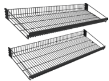
2', 3' or 4' Angled Wire Shelves – 14" or 16" width – Kit of 2