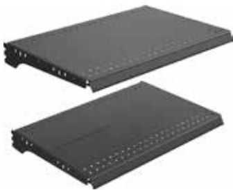
2', 3' or 4' Flat Metal Shelves – 14" or 16" width – Kit of 2