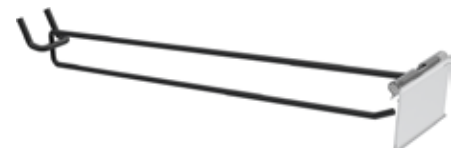
11" Peg Hook Kit – Kit of 18