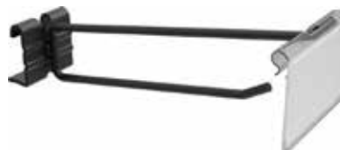
4" Peg Hook Kit – Kit of 18